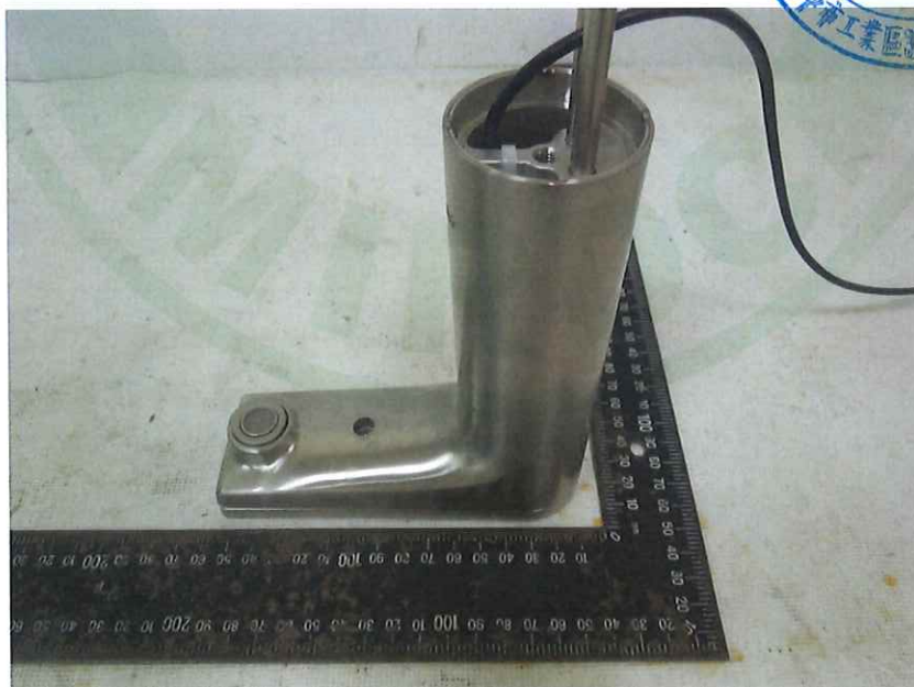
Front view of BC TAP

Note : (1). This report is responsible for designated samples only. (2). Reproduction of all or parts of this report without a written approval is strictly prohibited.