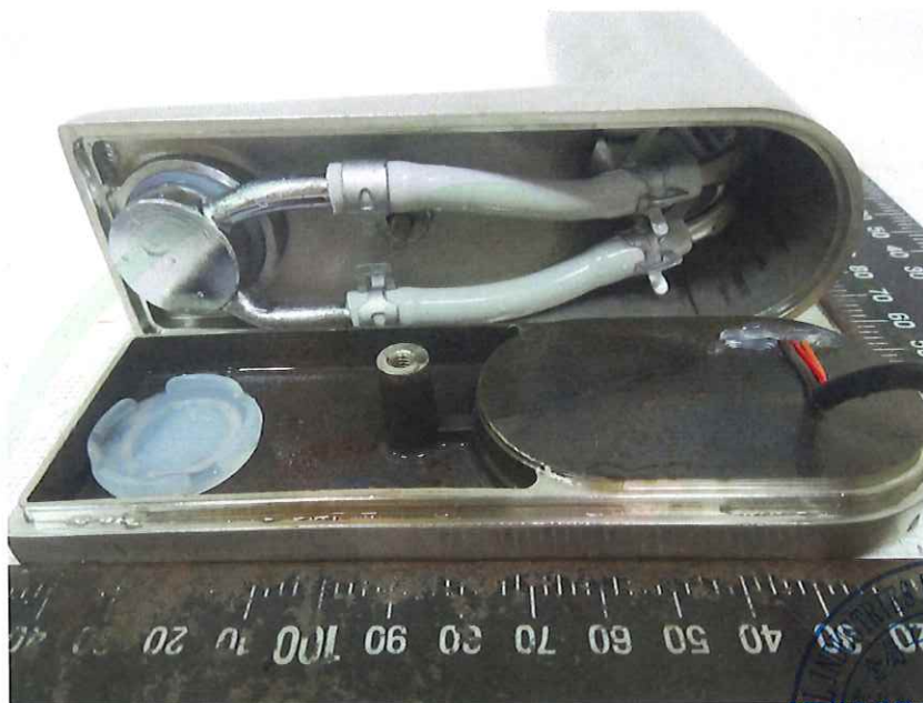
Front view of BC TAP