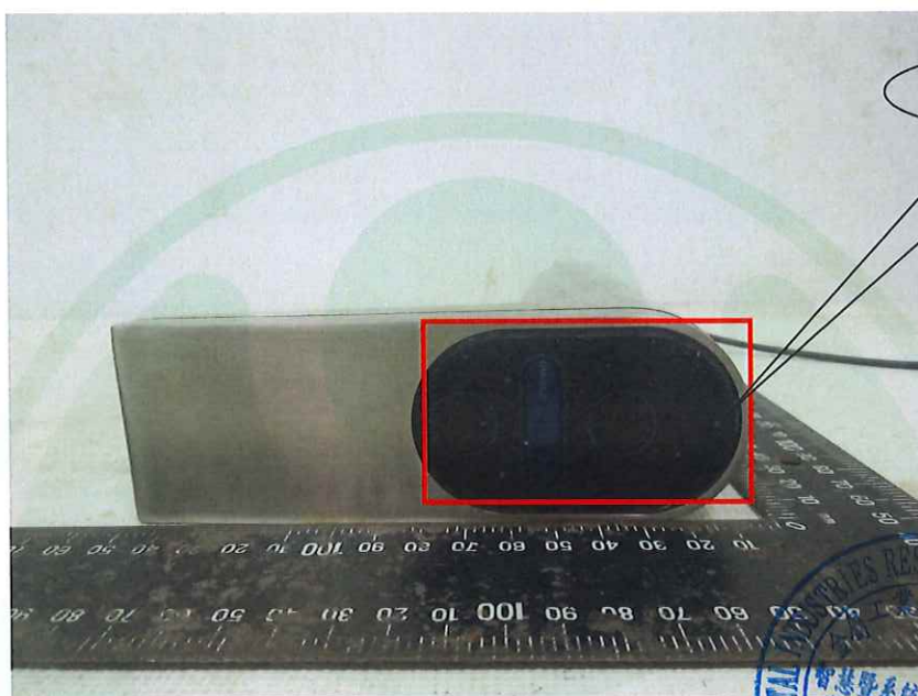
Front view of BC TAP